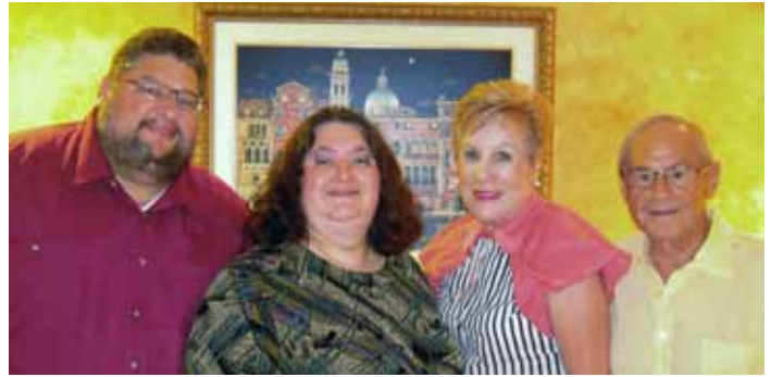
The Bards and The Waltzers

Over $5,000 was raised in support of the student loan fund by the poker tournament. We are already planning our next poker/Mah Jongg event. To get on the invitation list or if you are interested in hosting or helping, please contact us at the office, dhfla@sbcglobal.net , or call us at 214-693-3940.